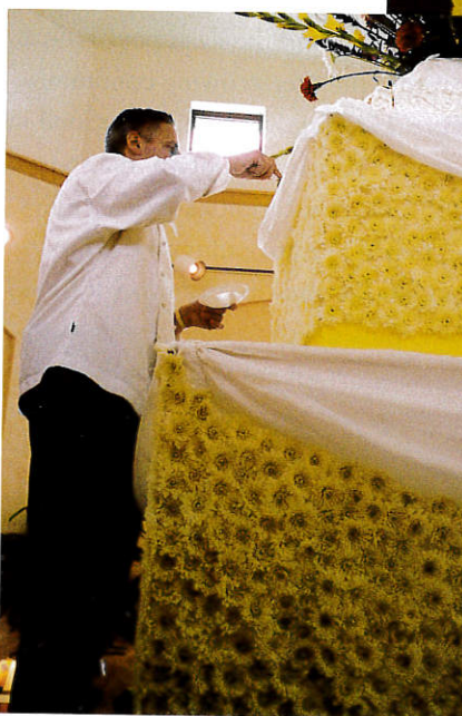
The pastry chef needed an 8-foot ladder to cut the cake — 768 pieces — throughout the weekend anniversary event.