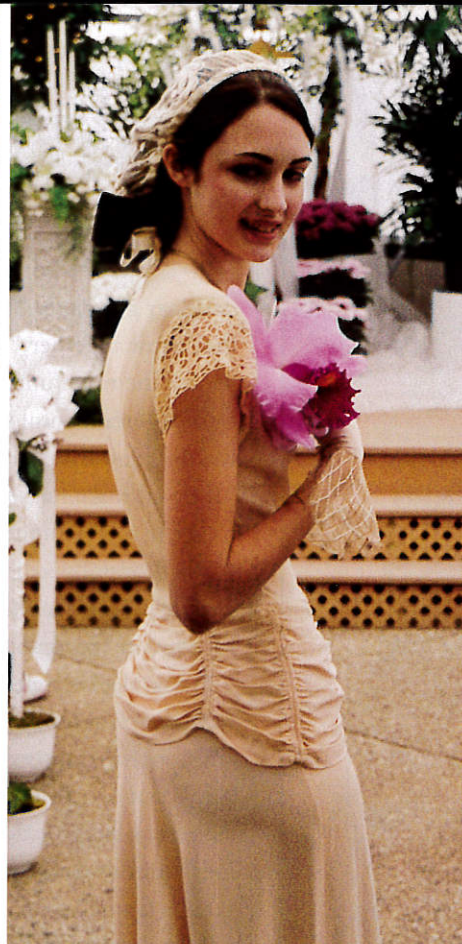
1930s bride with a bouquet of Tiger lilies, 1940s orchid corsage for the Mother of the Bride.

Floral Management's Marketer of the Year 11 th Annual 2004 Sponsored by Design Master color tool, Inc.