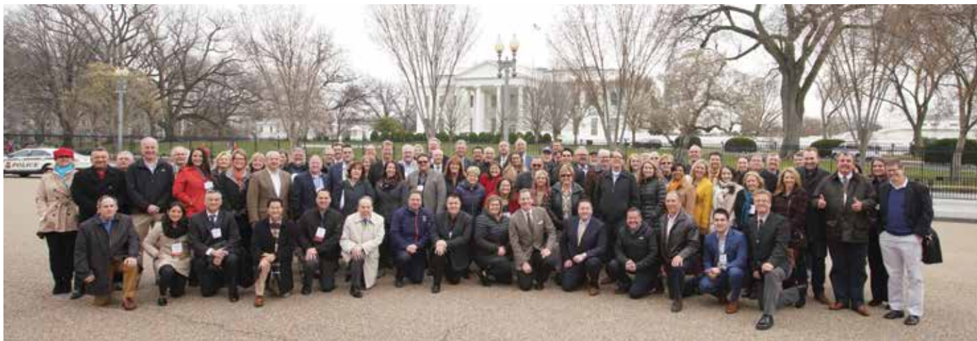
DREAM TEAM When industry members traveled to Washington, D.C., in March of this year for SAF's Congressional Action Days, they asked Congress for increased research funding and the publication of the 2018 Floriculture Crops Report.