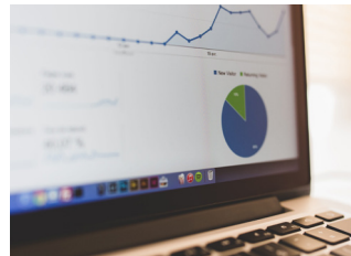
Marketing of Flowers 103