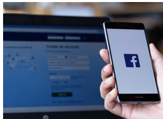
Marketing of Flowers 102