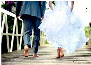
Wedding Trends 2021