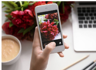
Marketing of Flowers 101