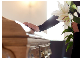
Sympathy Flower Designs