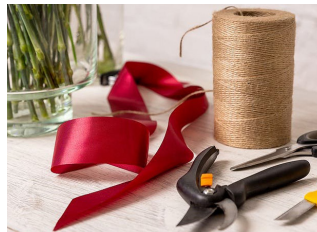
Foundational Floristry 1